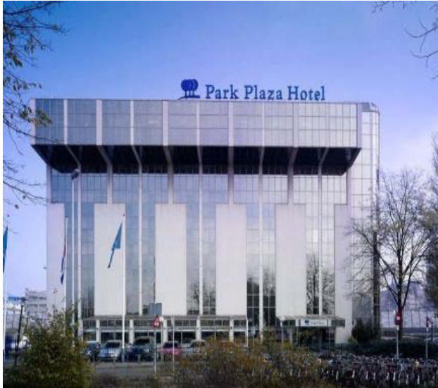
Hotel 1 Park Plaza Utrecht

It is less expensive if you book a hotel direct through an online booking service. Like expedia.com or bookings.com. We have two hotel suggestions