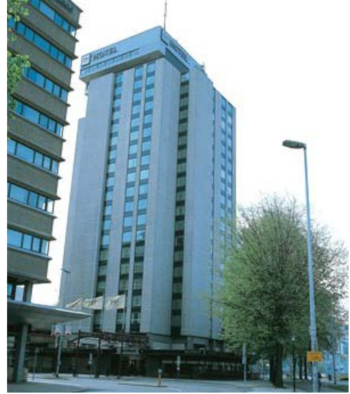
Hotel 2 NH Hotel Utrecht